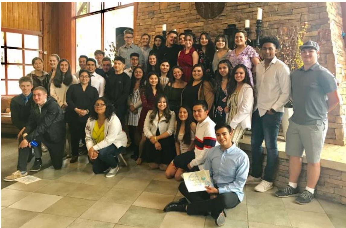
Class of 2019 Graduation at The Orchard in Carbondale