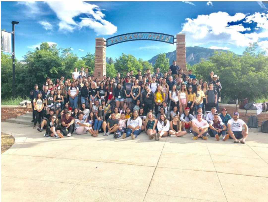
PreCollegiate Summer Program at CU Boulder, 2019