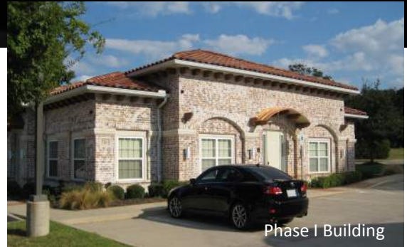
Phase I Building