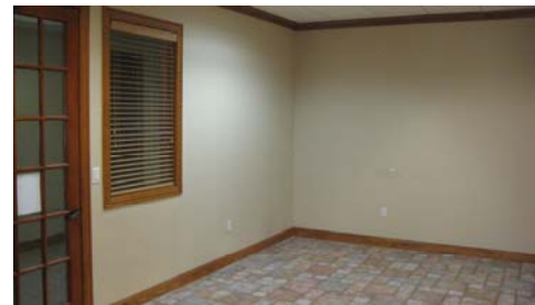
Spacious Reception Area