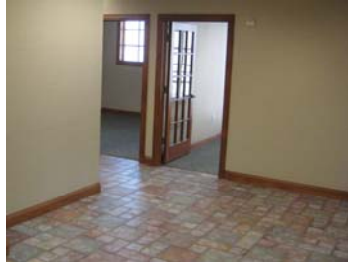
Warm, neutral colors with maple finish wood work and custom glass-pane doors.