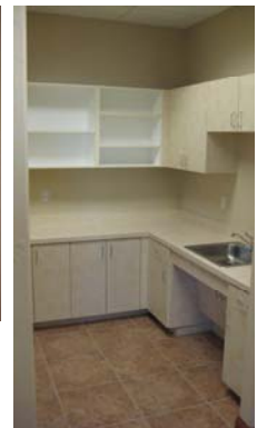
Beautiful custom finishout with wood trim and doors, tile floors throughout, window offices with abundance of natural light.